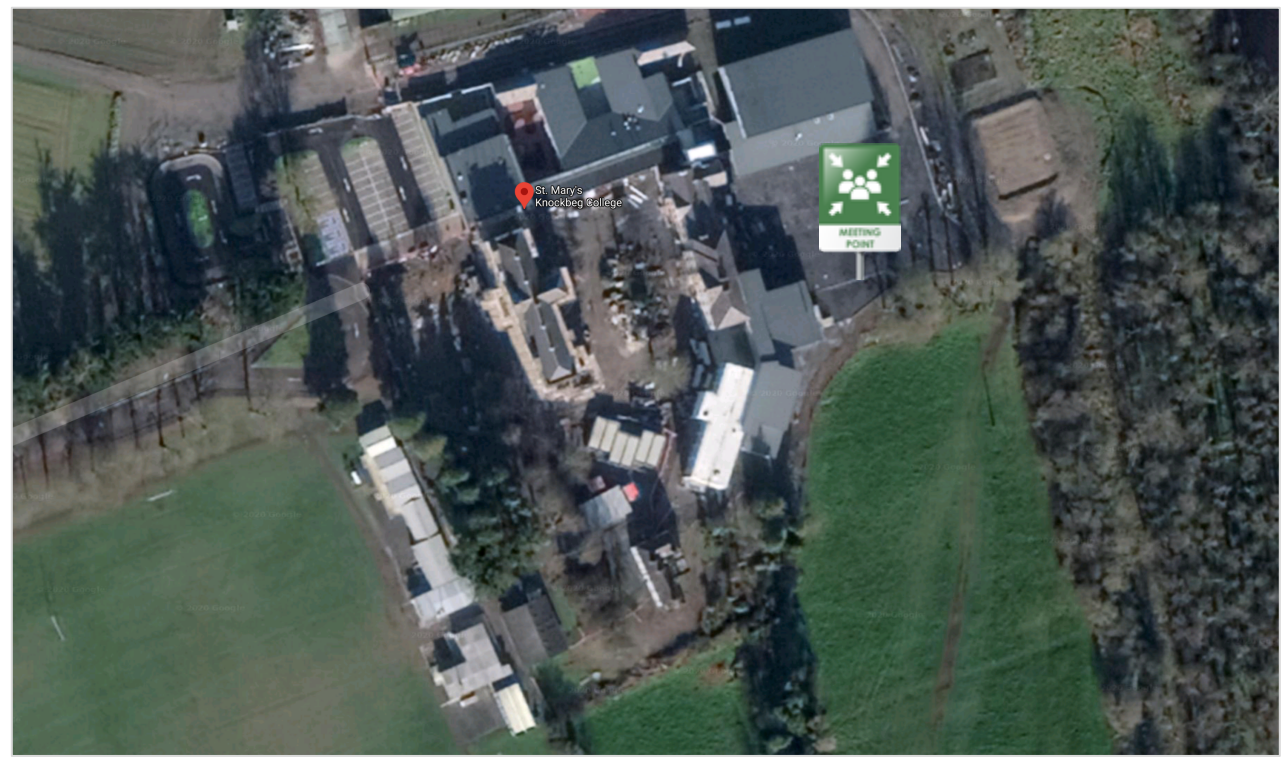
Figure: Approximate Location of Fire Assembly Points

Fire assembly points have been established in the Basketball Courts as indicated below. Signage has been posted each location. Signage will be spaced appropriately to prevent the congregation of hundreds of staff / students in the event of a drill.